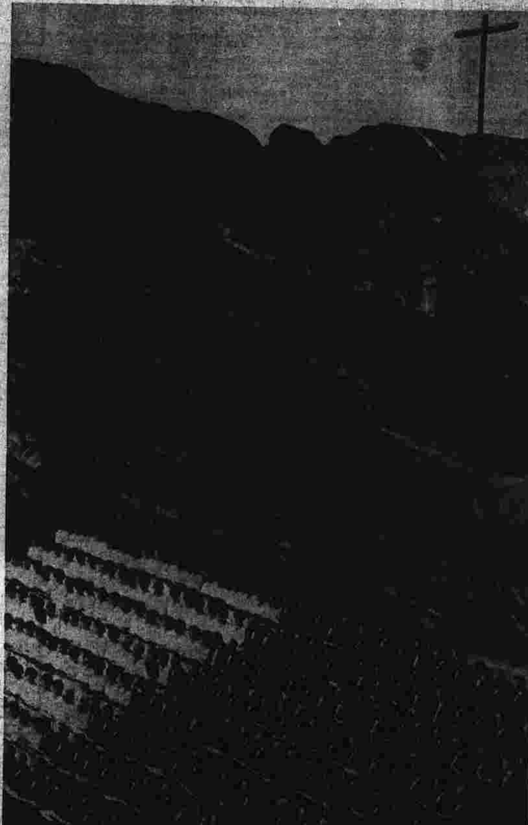
The Mormon Tabernacle Choir at Red Rocks, Colo., singing selections from Handel's "Messiah," on NBC's "Bell Telephone Hour" Sunday at 6:30 p.m.

One NBC game show that joined the lineup on another April will be celebrating its fourth birthday — "Jeopardy."