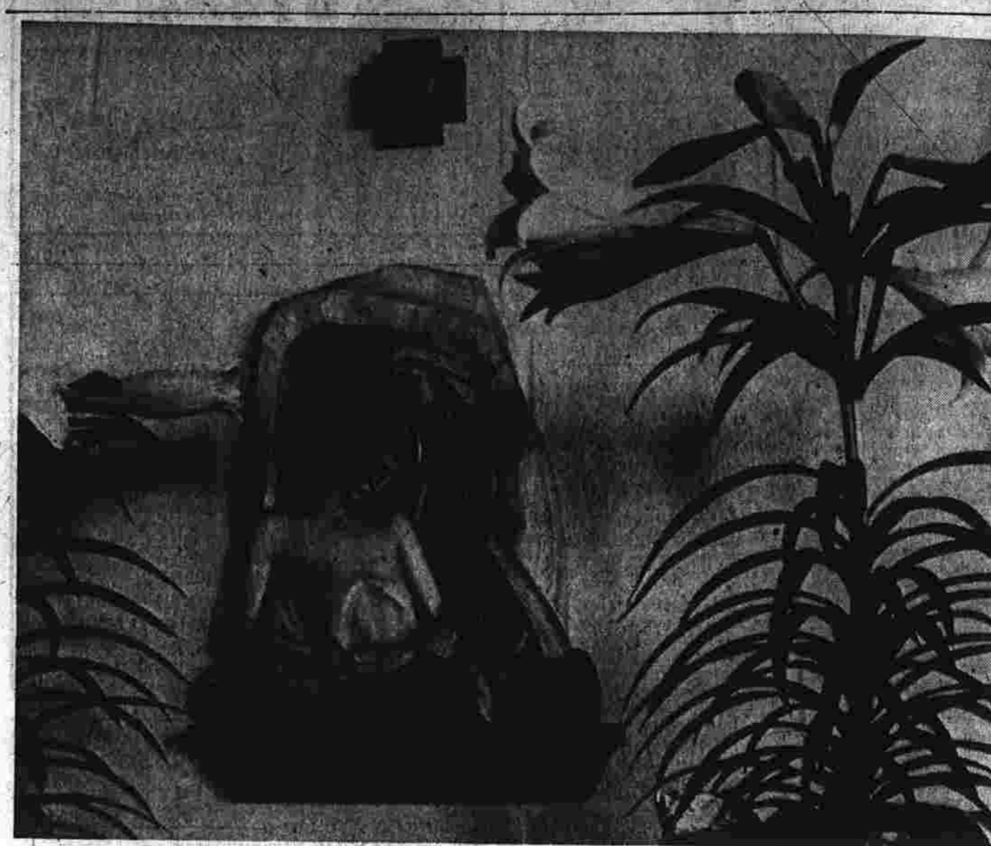
Lilies Symbolize Joyous Easter Season Easter lilies frame a wood carving of Jesus entombed, the 14th Station of the Cross at St. Bartholomew's Church. For centuries the white lilies have been emblematic of the joy of Easter and they will be displayed in many ways by area churches during services tomorrow.